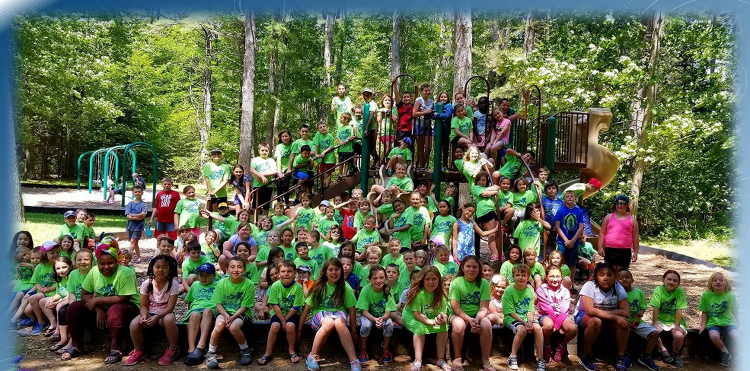
Bangor Blast Summer Camp